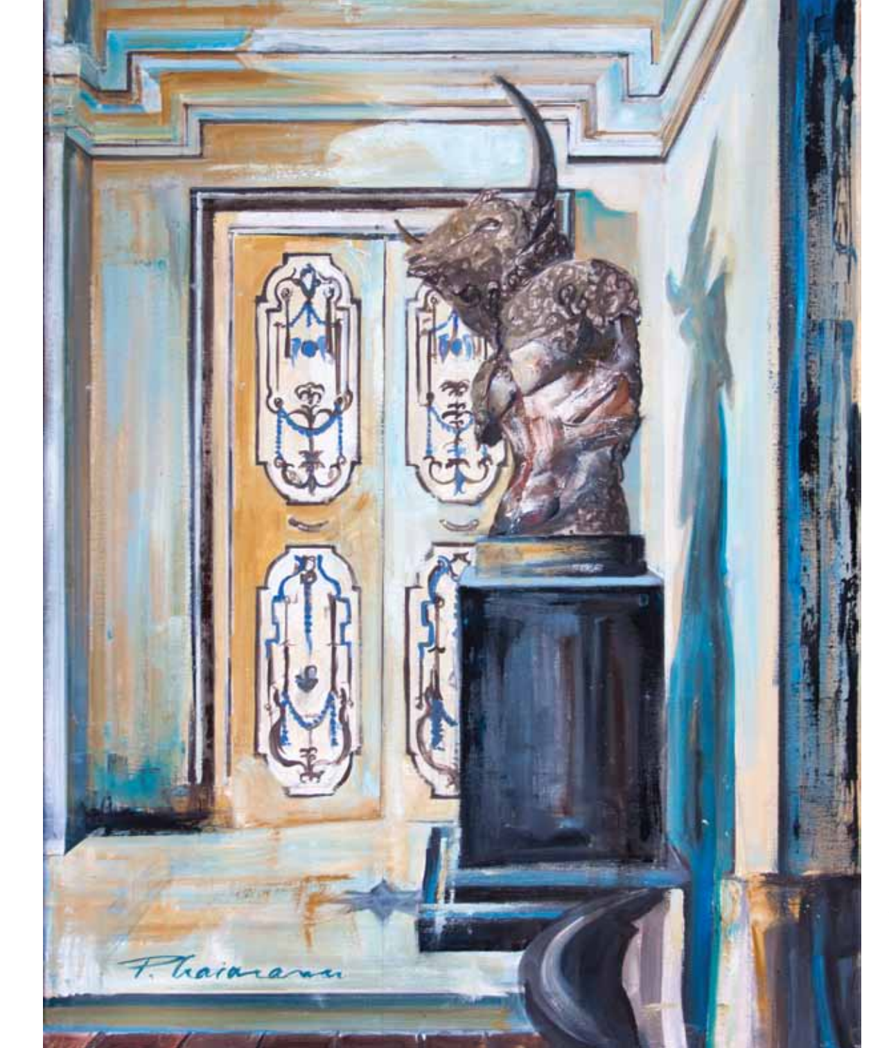
Minotaur in Interior, 2021, oil on canvas, 31.5x23.6in / 80x60cm