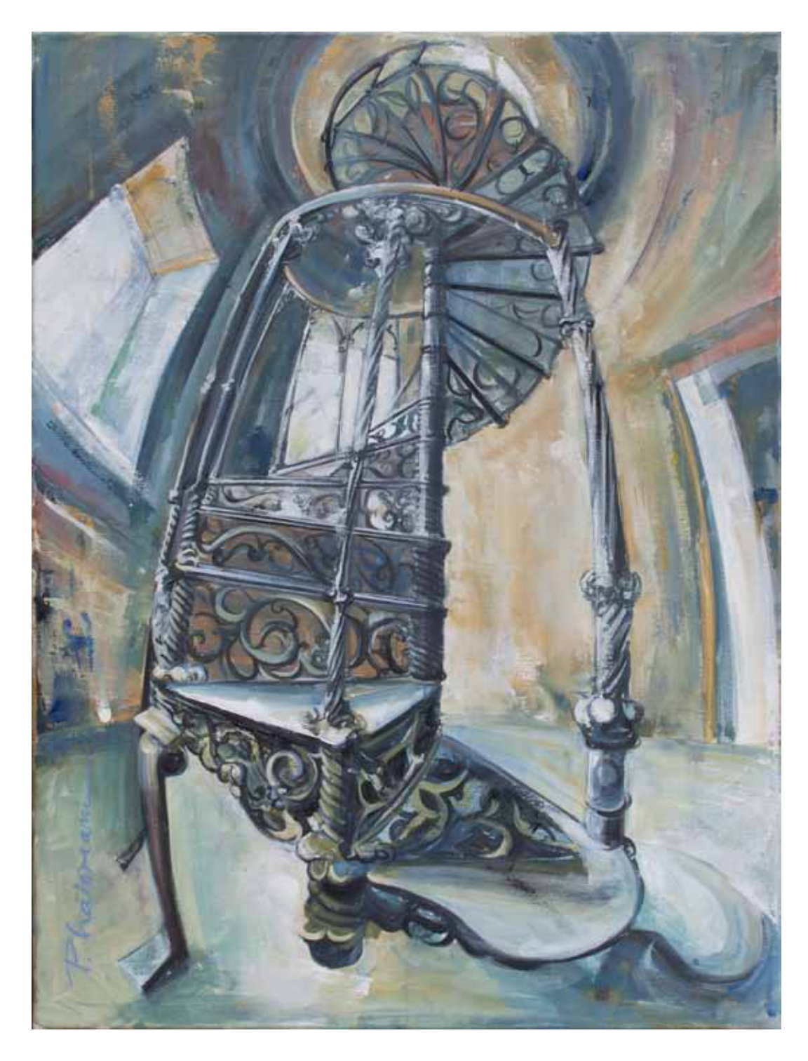
The Tower, 2021, oil on canvas, 31.5.5x23.6in / 80x60cm