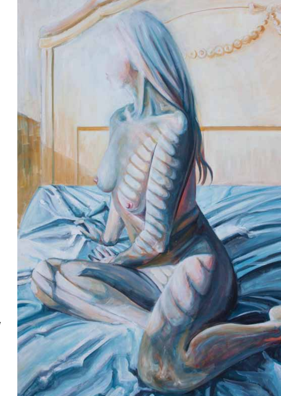
Nude in Morning Light, 2017, oil on canvas, 59x39in / 150x100cm