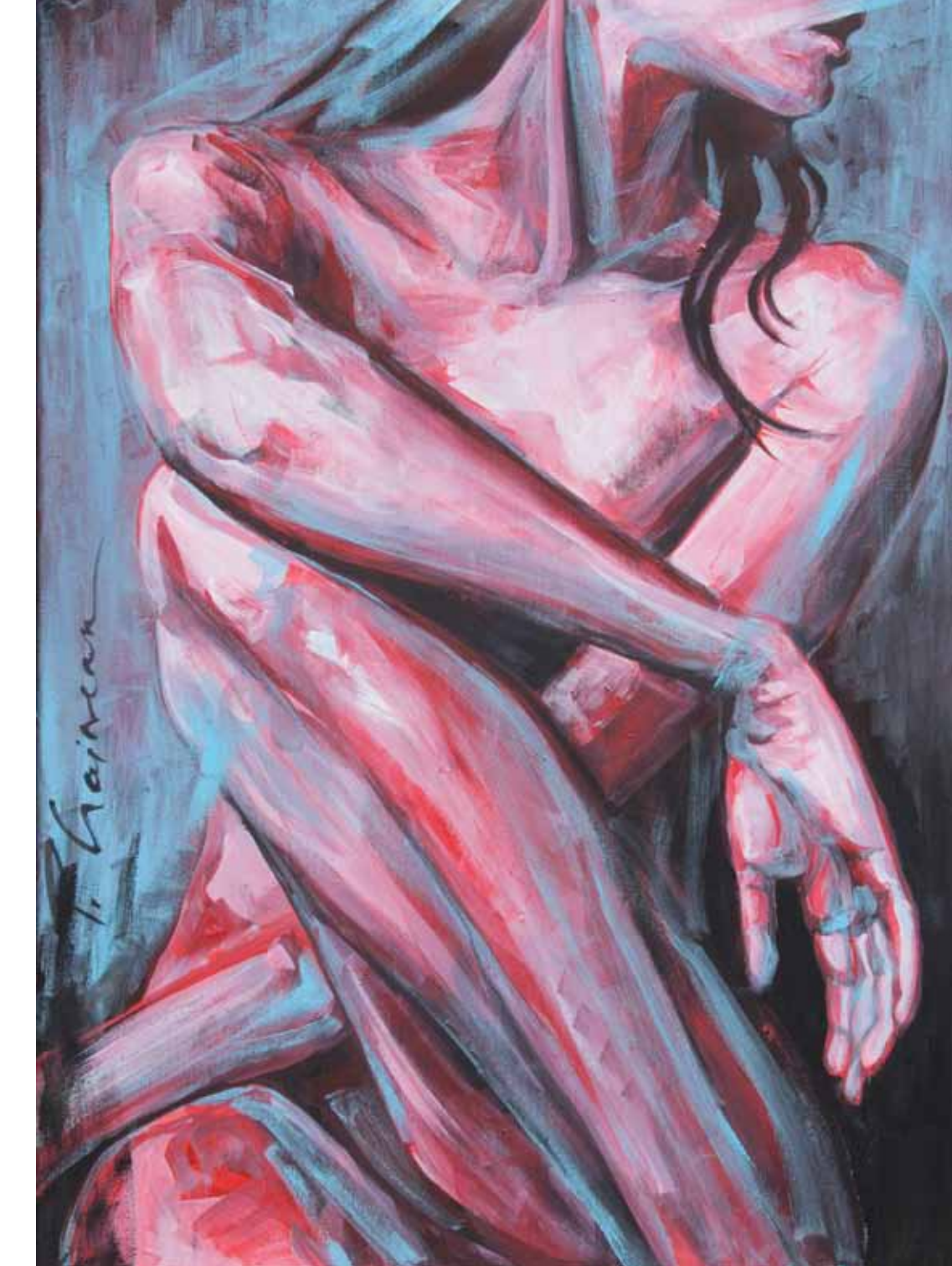
Nude , 2017, acrylic on canvas, 27.5x19.7in / 70x50cm

Nude in the Mirror, 2019, oil on canvas, 27.5x23.5in / 70x60cm