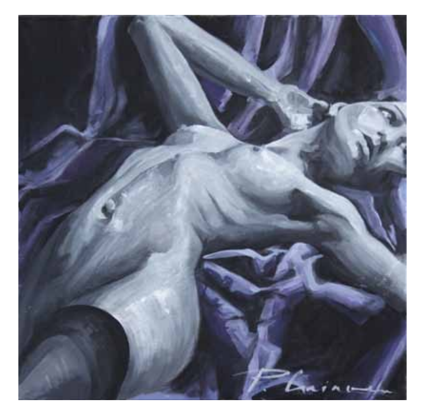
Nude 1, 2012, acrylic on canvas, 27.5x27.5in / 70x70cm

Nude 2, 2012, acrylic on canvas, 27.5x27.5in / 70x70cm