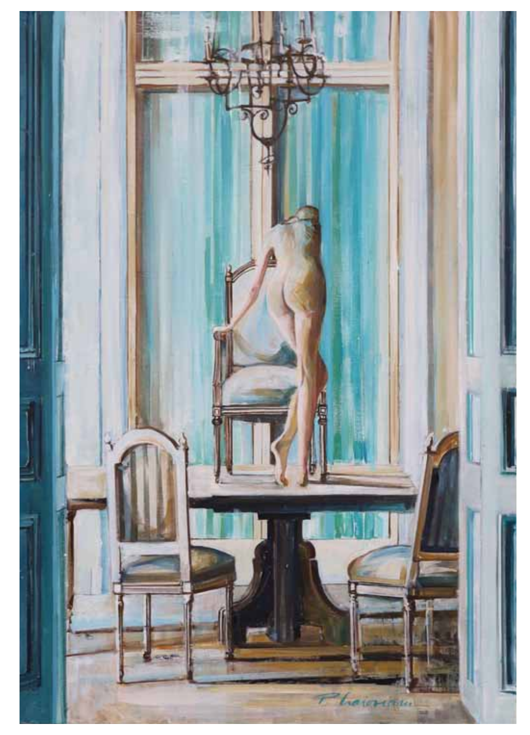
Nude in Interior, 2019, oil on canvas, 39.4x27.5in / 100x70cm