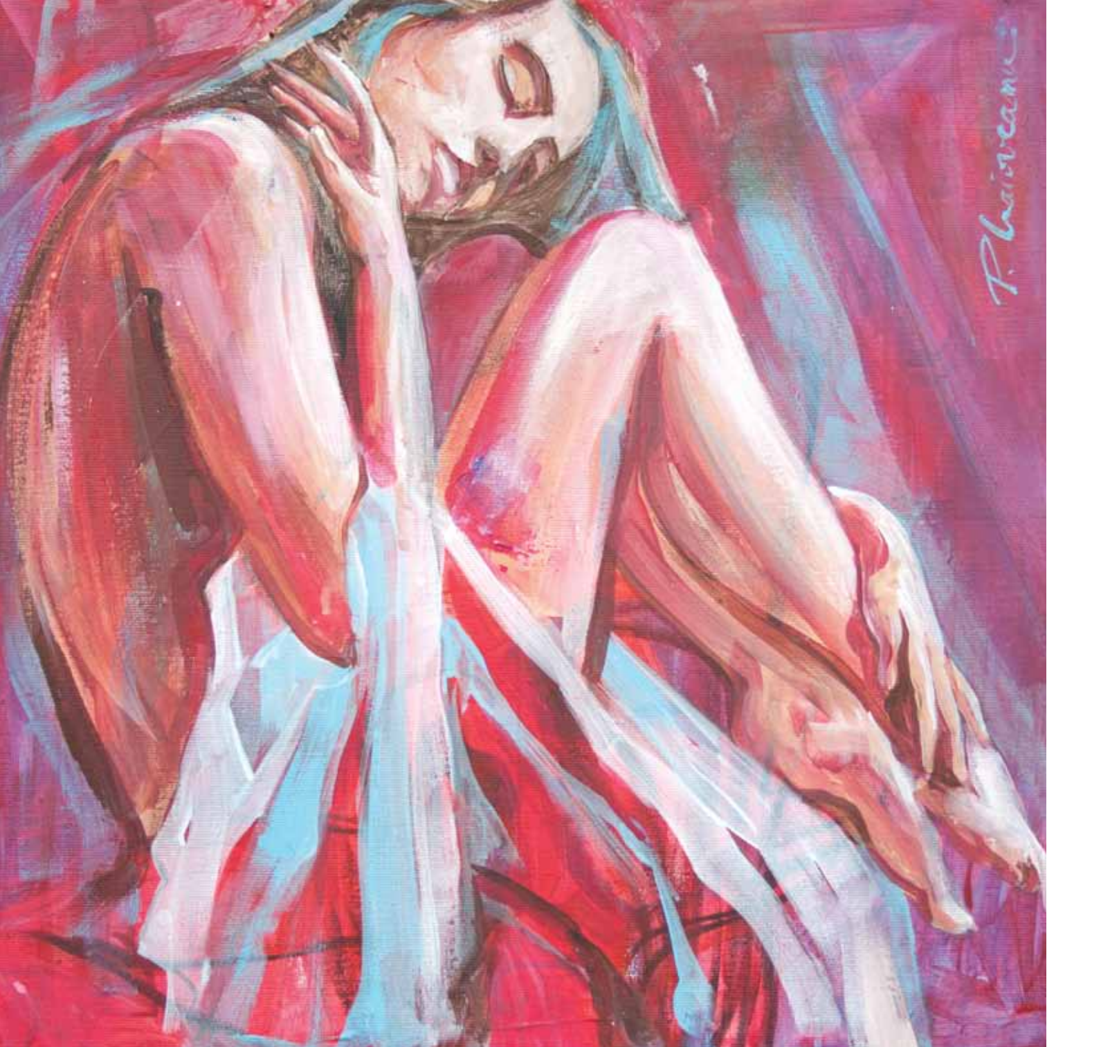
Ballerina, 2021, acrylic on canvas, 15.7x 15.5in / 40x40cm