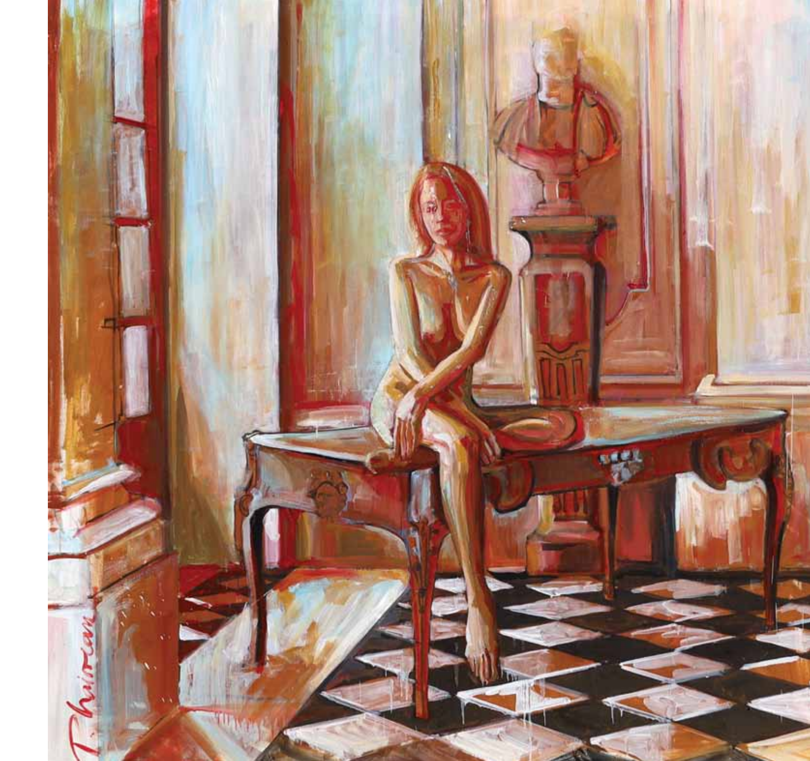
Nude in French Interior, 2022, oil on canvas, 59x59in / 150x150cm