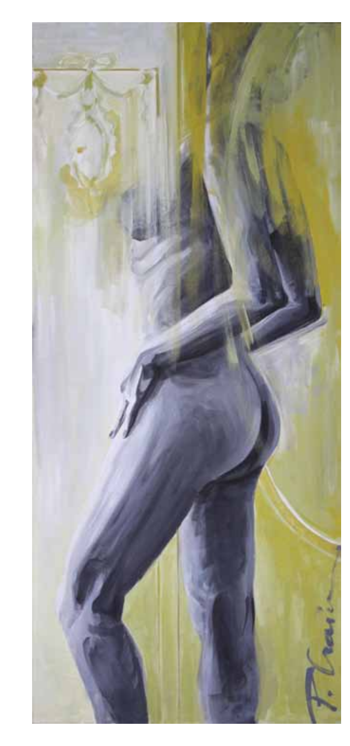
Morning, 2006, acrylic on canvas, 43.3x 19.6in / 110x50cm