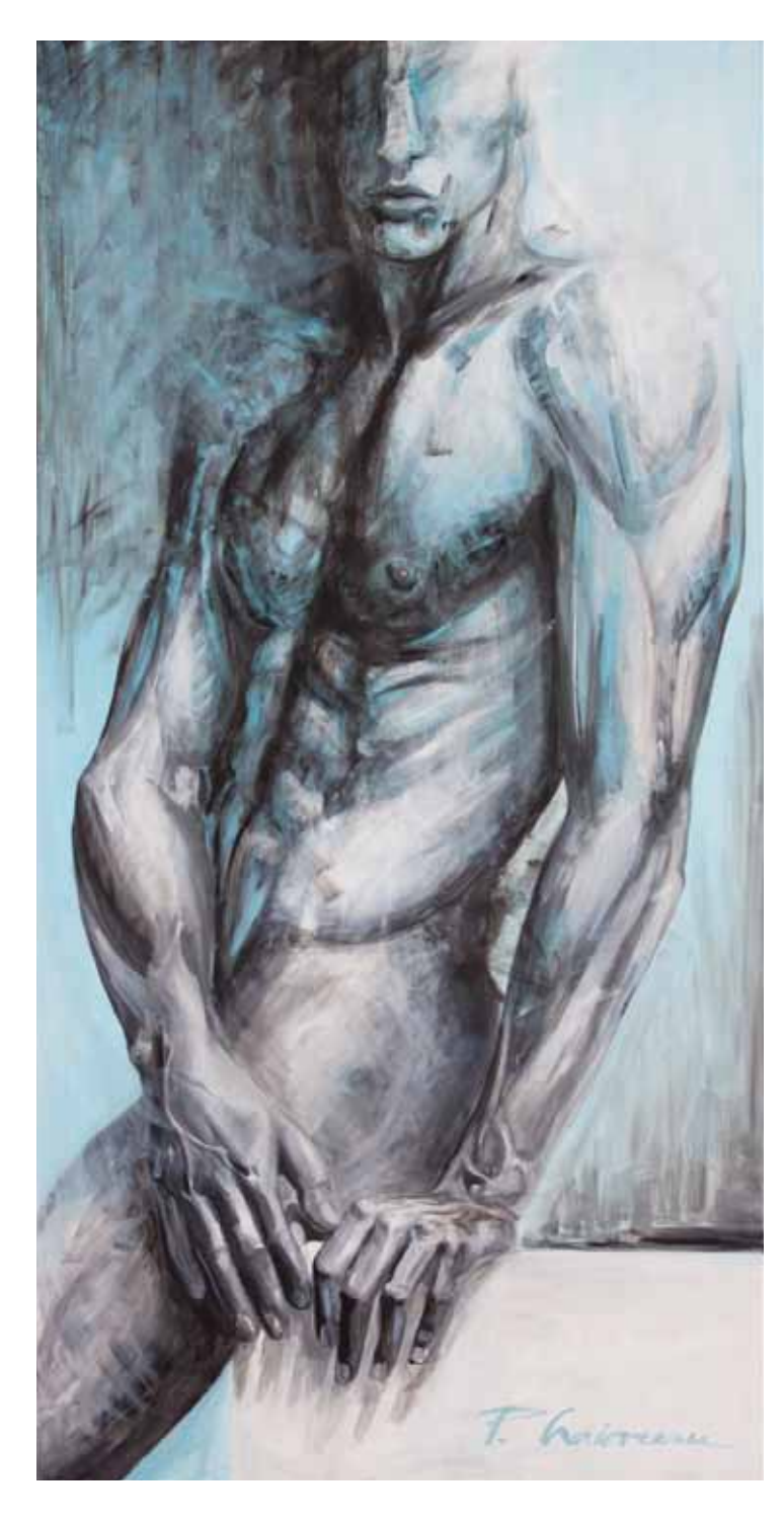
Amphibian Man, 2016, acrylic on canvas, 78.8x 39.4in / 200x100cm